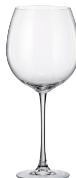
02B4G009850 Magnum 850 ml H: 265 mm / Dia: 115 mm 6 pcs / 12 pcs