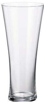
02B2G006360 / 6 pcs Pilsner 360 ml H: 180 mm / Dia: 80 mm 6 pcs / 24 pcs