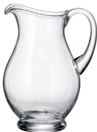
02W1G111044 Pitcher 1500 ml H: 235 mm / Dia: 145 mm 1 pc / 12 pcs