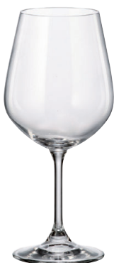
02B4G008460 Red wine 460 ml H: 201 mm / Dia: 92 mm 6 pcs / 24 pcs