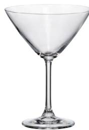
02B4G001280 / 6 pcs Martini 280 ml H: 179 mm / Dia: 132 mm 6 pcs / 24 pcs