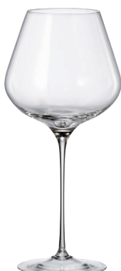
006275 Red wine 925 ml H: 278 mm Black box 2 pcs