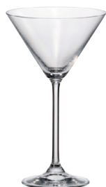
02B4G009150 Martini 150 ml H: 190 mm / Dia: 110 mm 6 pcs / 12 pcs