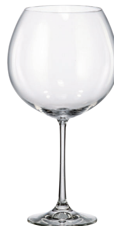
02B4G004960 Burgundy 960 ml H: 240 mm / Dia: 127 mm 6 pcs / 24 pcs