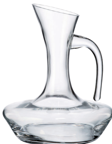
02B386611250 Decanter 1250 ml H: 250 mm 1 pc / 4 pcs .....