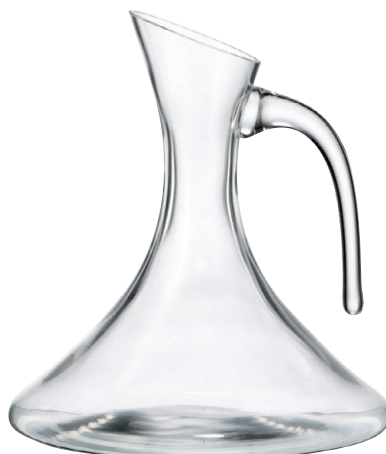
02B386601500 Decanter 1500 ml H: 245 mm 1 pc / 4 pcs