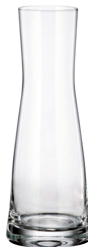
02B33074800 Carafe 800 ml H: 270 mm / Dia: 101 mm 1 pc / 12 pcs