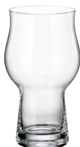
02B2G010520-12IB Tumbler beer 520 ml H: 192 mm / Dia: 84 mm 12 pcs