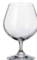
02B4G009405 Brandy 405 ml H: 143 mm / Dia: 96 mm 6 pcs / 12 pcs