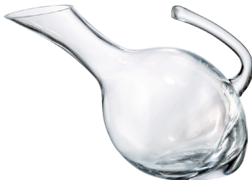
02B386631250 Decanter 1250 ml H: 200 mm 1 pc / 4 pcs .....