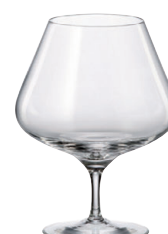
006282 Cognac 780 ml H: 165 mm Black box 2 pcs