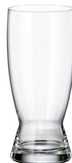
02B2G010630-12IB Tumbler beer 630 ml H: 182 mm / Dia: 84 mm 12 pcs