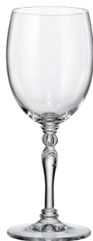
02B4G005250 Red wine 250 ml H: 185 mm / Dia: 62 mm 6 pcs / 24 pcs