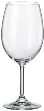
02B4G006430 / 6 pcs Red wine 430 ml H: 208 mm / Dia: 86 mm 6 pcs / 24 pcs