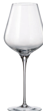
006277 Red wine 750 ml H: 269 mm Black box 2 pcs