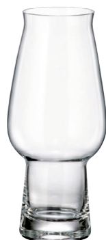
02B2G010580-12IB Tumbler beer 580 ml H: 160 mm / Dia: 91 mm 12 pcs