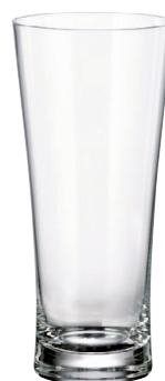
02B2G010540-12IB Tumbler beer 540 ml H: 187 mm / Dia: 85 mm 12 pcs