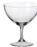
02B4G001360 Ice cream goblet 360 ml H: 120 mm / Dia: 131 mm 6 pcs / 24 pcs