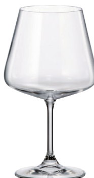
02B4008565 Burgundy 565 ml H: 192 mm / Dia: 108 mm 6 pcs / 24 pcs