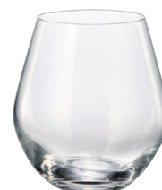
02B2G008550 Whisky 550 ml H: 112 mm / Dia: 103 mm 6 pcs / 24 pcs