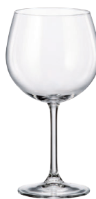
02B4G001570 / 6 pcs Red Wine Ballon 570 ml H: 219 mm / Dia: 107 mm 6 pcs / 24 pcs