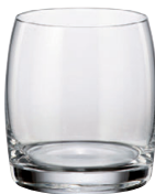
02B2G006280 / 6 pcs Whisky 280 ml H: 88 mm / Dia: 81 mm 6 pcs / 24 pcs