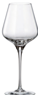
006276 White wine 490 ml H: 239 mm Black box 2 pcs