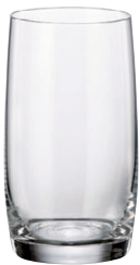
02B2G006380 / 6 pcs Long drink 380 ml H: 128 mm / Dia: 71 mm 6 pcs / 24 pcs