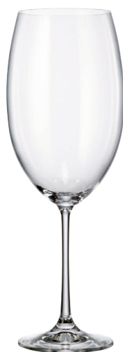
02B4G004800 Red Wine 800 ml H: 275 mm / Dia: 98 mm 6 pcs / 24 pcs